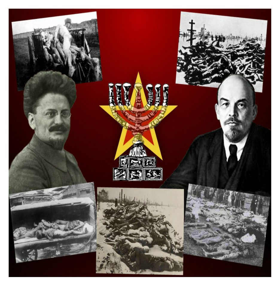
Death and destruction -- the legacy of Jewish Communism!

Words cannot do justice in describing the merciless bloodlust of these Marxist Jews. Many of the leading Jewish rulers of Russia forthrightly announced their murderous desires and genocidal ambitions. All the Jewish Bolshevik leaders were teeming with an implacable hatred for everything Russian and sought to exterminate the very concept of race, nationality and culture.